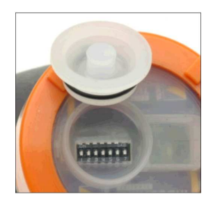
Remove protective lid and switch on lube dispenser