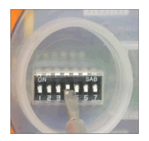
Dosage about dip switch carry out. Green LED flashes turn all switches down everything 30 sec.