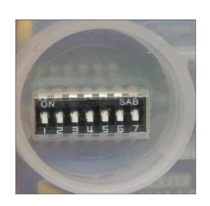
To switch off: